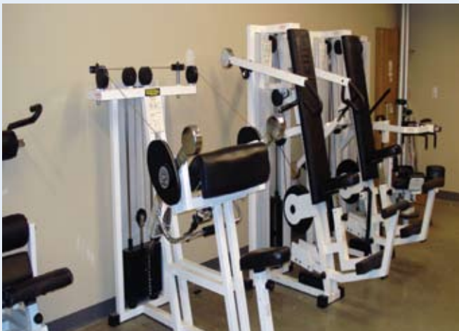
▲ Fitness Equipment donated by Calvin College