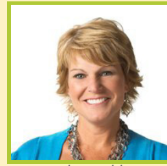
Moderated by: Maranda WOTV 4 Women