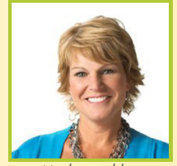
Moderated by: Maranda WOTV 4 Women